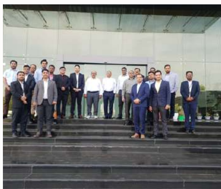
HORIBA INDIA PRIVATE LIMITED