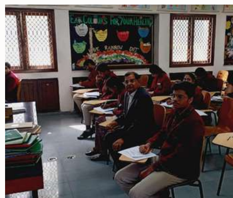
DAV FERTILIZER PUBLIC SCHOOL