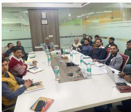
EDGETECH AIR SYSTEMS PVT. LTD.