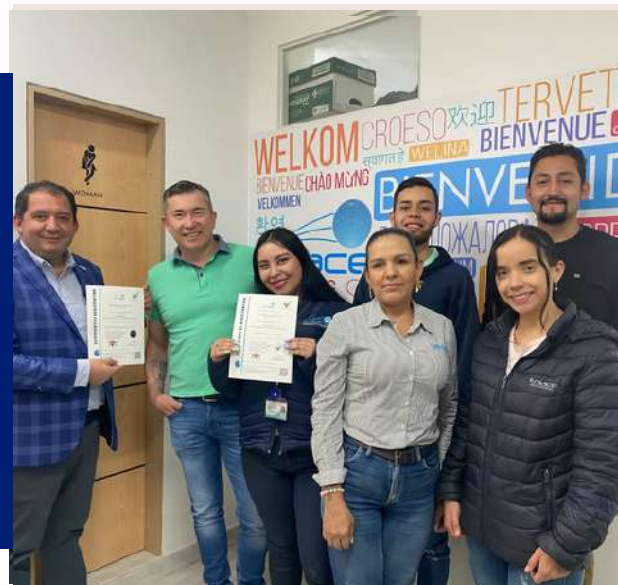
ENLACE MULTIMODAL LOGISTIC LTDA