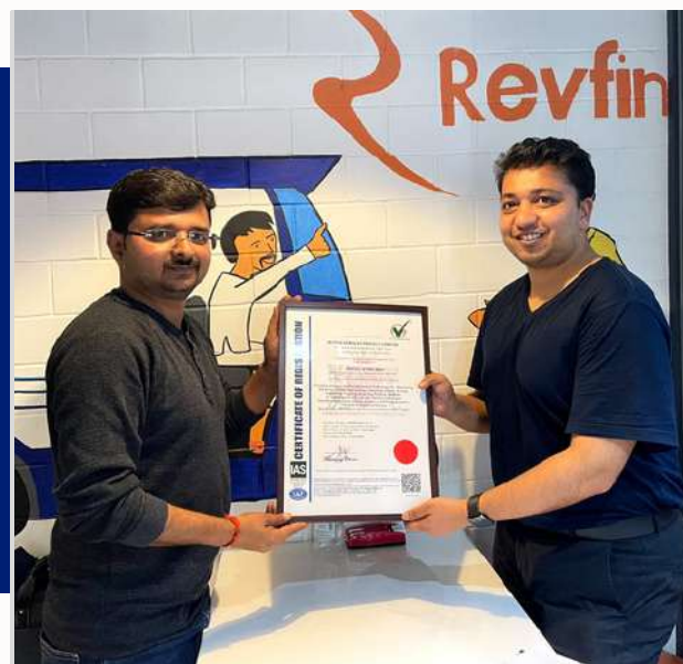
REVFIN SERVICES PRIVATE LIMITED