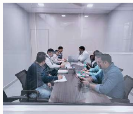
WELDON BIOTECH INDIA PVT. LTD.