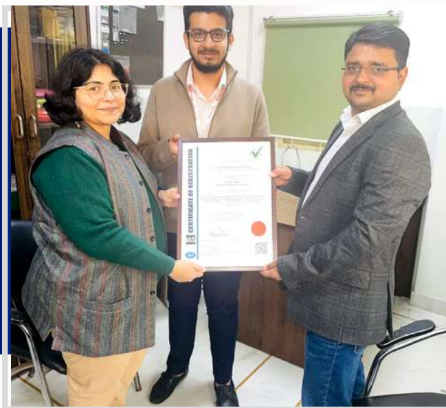
PRANAV TECHONE PRIVATE LIMITED