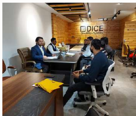
DICE OFFICE SYSTEMS