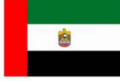
United Arab Emirates