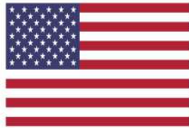
United States of America