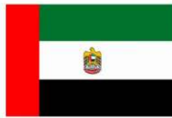
United Arab Emirates